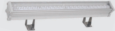
Surface Mounted Wallwasher 24 LED's